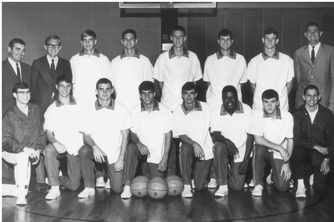
Pictured here are the original Jaguars – the first basketball team at the University of South Alabama. On May 22, 1966, the USA Board of Trustees unanimously approved the hire of a “first class” basketball coach and 20 scholarships to be awarded over a two-year period.