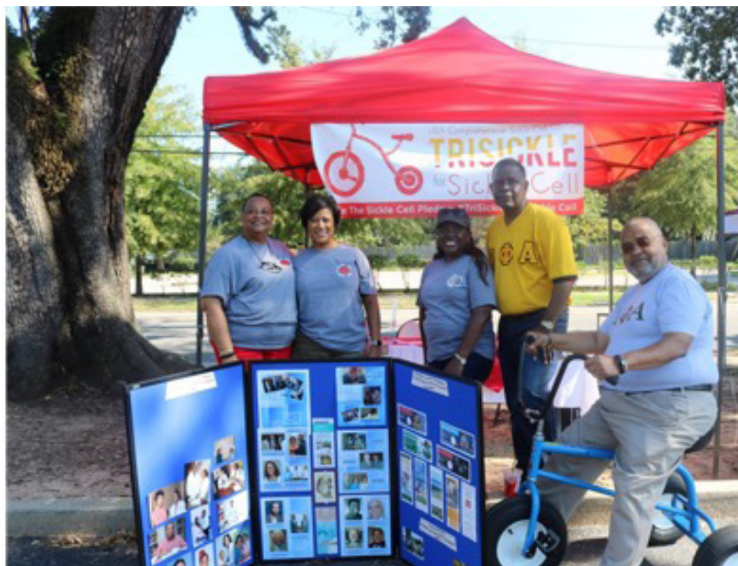
TRISICKLE for Sickle Cell Campaign

As a result of mandatory newborn screening, penicillin prophylaxis, and pneumococcal vaccines, the life expectancy of babies born with sickle cell disease (SCD) in the United States has improved to the 4th and 5th decades of life. While survival with SCD has improved, one-third of adolescents and young adults delay or do not successfully transition to adult care and are lost to medical follow-up for the management of their SCD and