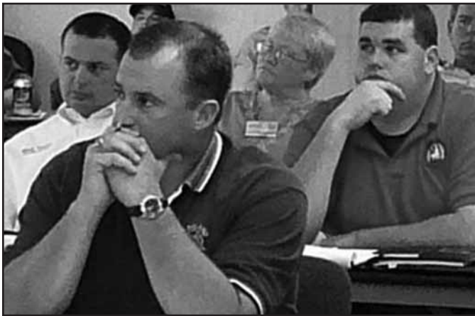
Trauma Systems Training Seminar