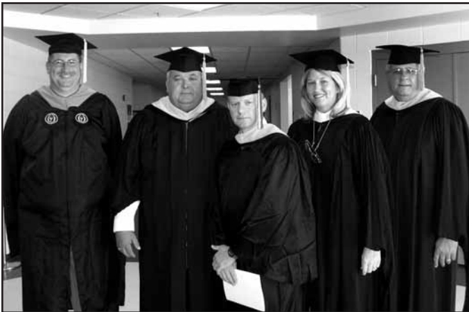
Faculty in graduation regalia