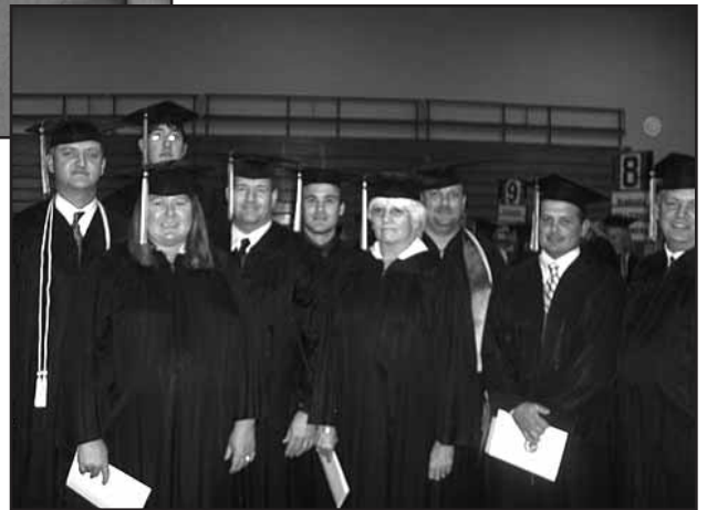
Graduation, May 9, 2009

In addition to completing the General Education and Paramedic Core requirements of the curriculum, these students completed a 34 semester hour EMS Core, which consisted of courses such as EMS Systems, EMS Law & Legal Issues, and EMS Research, to name a few.