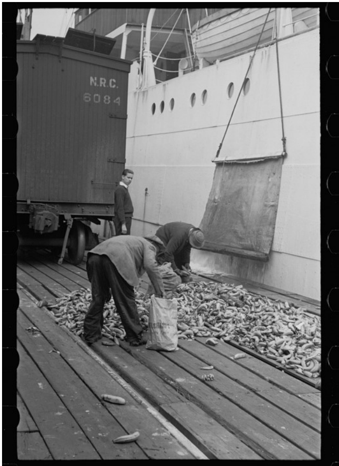
Banana Docks fruit spoilage pile

The Mobile Banana Dock's were a large open-air city market constructed in 1857, six blocks north-northeast of site 1MB564. Historic maps and directories show this neighborhood, known as Down the Bay, was first settled in the late-1800s. The market, historically called the Banana Docks, was associated with The Port of Mobile; of which brought large shipments of fruits and vegetables from southern regions of the world. In the early 1900s, The United Fruit Company docked their boat fleets at the Banana Docks where primarily black migrants would gather for a daily wage unloading, counting, and sorting bananas from boats to railcars (Pinney 1989).