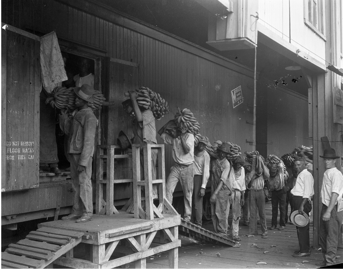
Banana dock workers loading bananas.